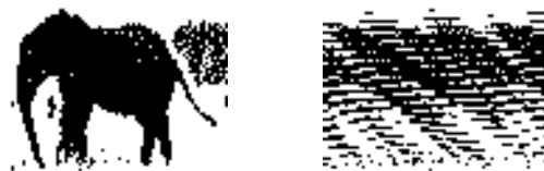
Fig. 3. An elephant picture and one of its permutations.

lower-level features such as lines, curves and similar basic components but these are still too abstract to depend on particular pixels; we need another abstraction level closer to the physical features. To convince those who are still in doubt imagine that the positions of the pixels of the picture are mixed by a deterministic and invertible algorithm so the elephant cannot be recognized anymore by looking at the picture (see Figure 3). Let the fitness function be the original