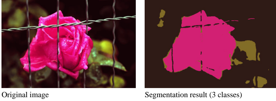
Figure 1: Segmentation of image rose41 .

data in subsequent move types. Therefore as long as our input image can be described by a mixture of Gaussians, we can expect that the estimated covariance matrices are correct.